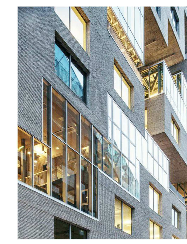
5 PROPOSED GLAZED CURTAIN WALL