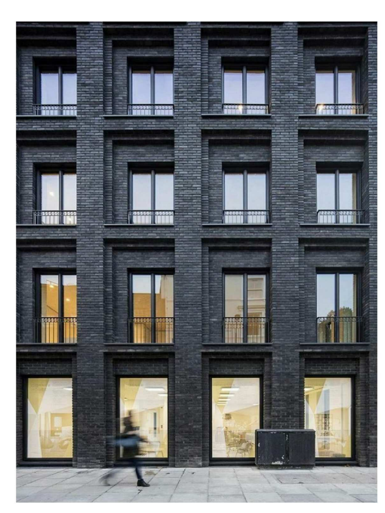
2 PROPOSED DARK BRICKWORK FACADE