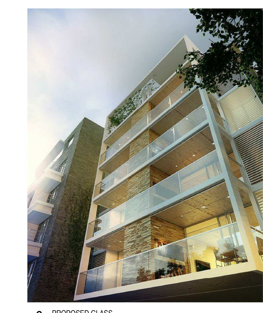
6 PROPOSED GLASS RAILING