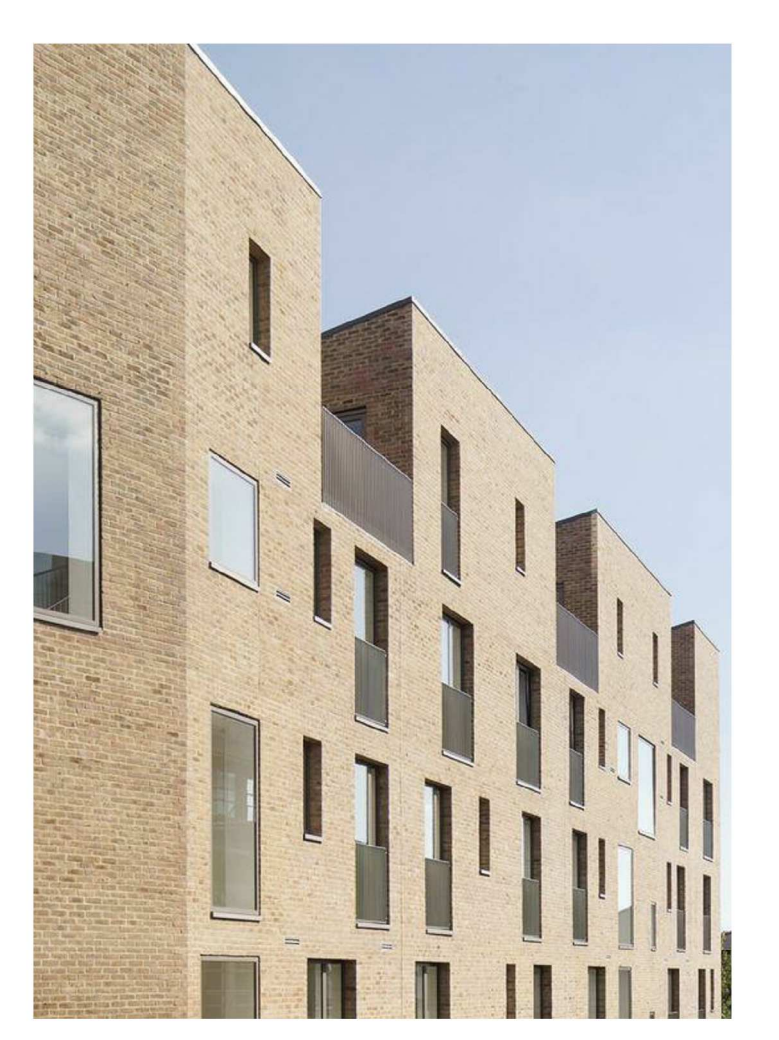
PROPOSED LIGHT BRICKWORK FACADE