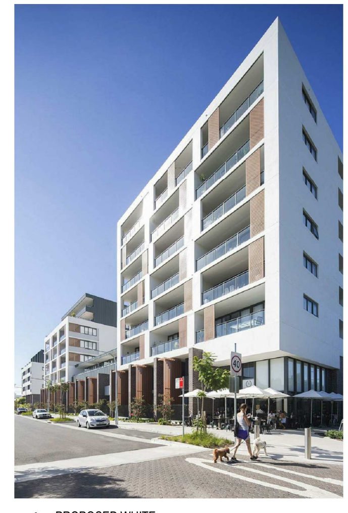
4 PROPOSED WHITE COLOURED RENDER FINISH