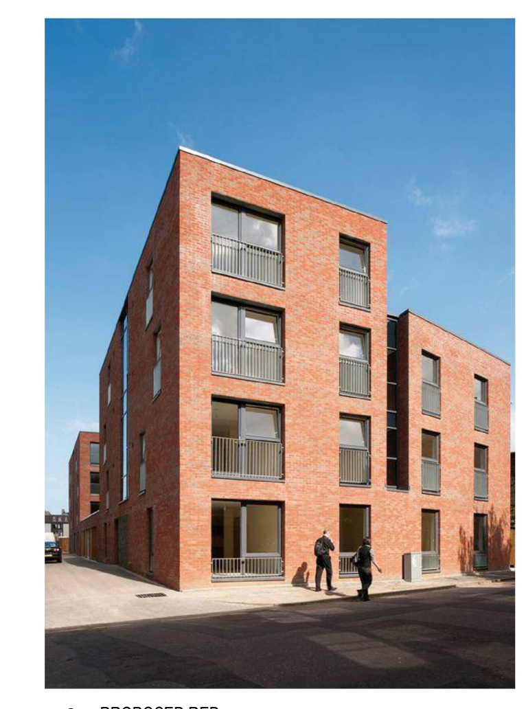
3 PROPOSED RED BRICKWORK FACADE